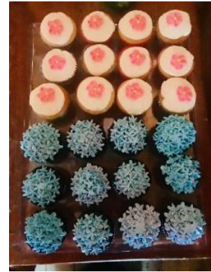
Talented bakers, including Sophia Vitello, made horticulturally inspired desserts for our Historic Landscape Tour.