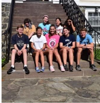
Tufts Focus students helped weed our ivy beds.