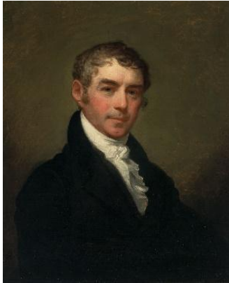
On October 8 th SEHA acquired Gilbert Stuart's portrait of William Eustis from the Metropolitan Museum of Art. William Doyle Galleries, Inc. served as auctioneer.