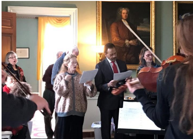
Annual Holiday Party, December 8th Traditional caroling in the Great Hall was accompanied by violins.