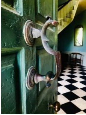
Friends with an artistic eye, including Tina Rodocker, took many memorable photographs