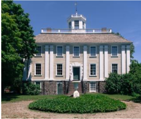
The Mansion's major exterior paint and wood repair project was completed in the fall. Shown here in July before shutters were re-hung, the Georgian pilasters appear even more prominent.

The Buildings and Grounds Committee oversaw the completion of a major project involving the painting of the Mansion's exterior and repair/replacement of portions of its clapboarding and wood. 2W Painting Inc. and NAPCO served as contractors. The Committee also worked closely with the Executive Director to identify top priorities for grant applications.