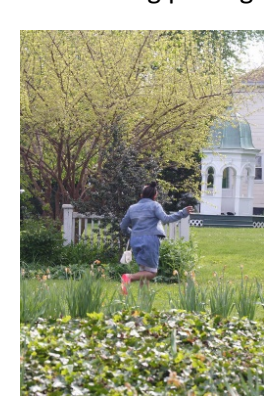
A child found delight skipping through our grounds following the Mother-Daughter Tea.