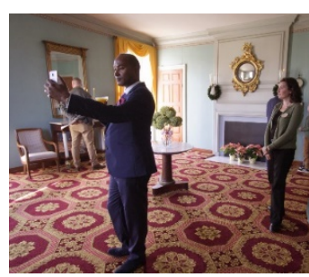
Holiday party guests explored the Drawing Room.