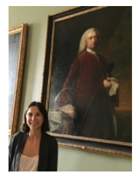
A Shirley descendant visited from England in September.