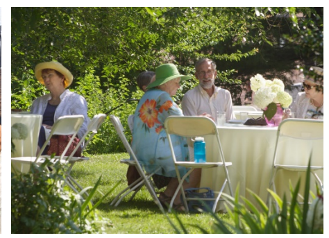
July 15<sup>th</sup> A Summer Garden Party was held in collaboration with Old South Meetinghouse.