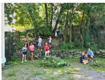
Tufts University FOCUS students. In late August incoming Freshmen helped clean and organize the Carriage House and weed its gardens.