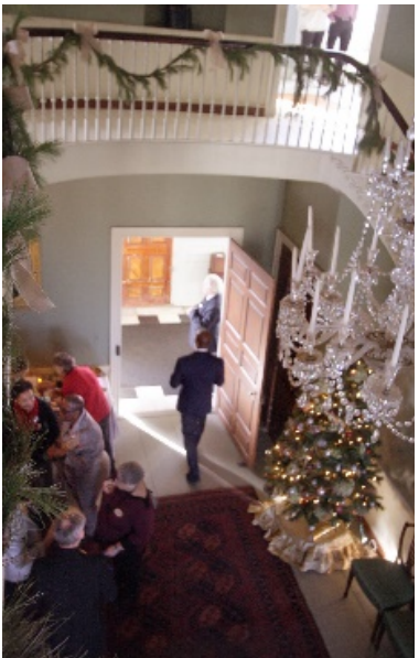
View of the Great Hall from a balcony.