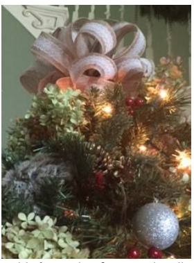
Dahlia's Garden features locally grown flowers and foliage in their designs.